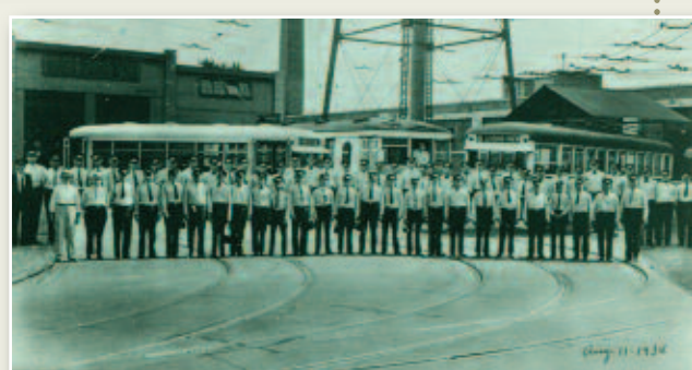
Knoxville Bus Drivers in 1934.